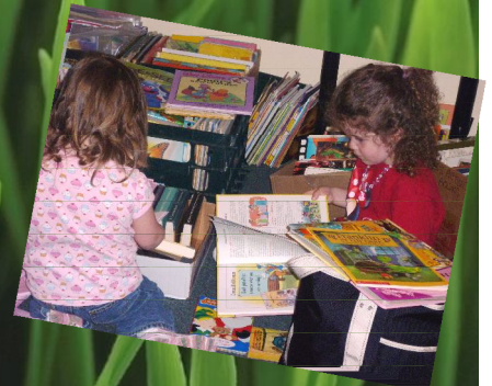
Young Booksale Browsers